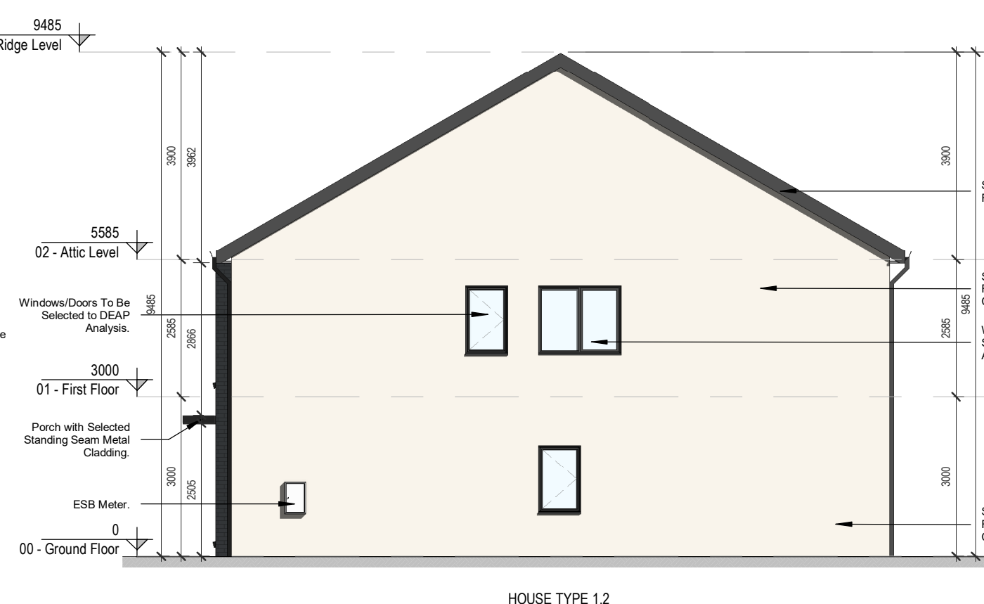
8 SIDE ELEVATION 2