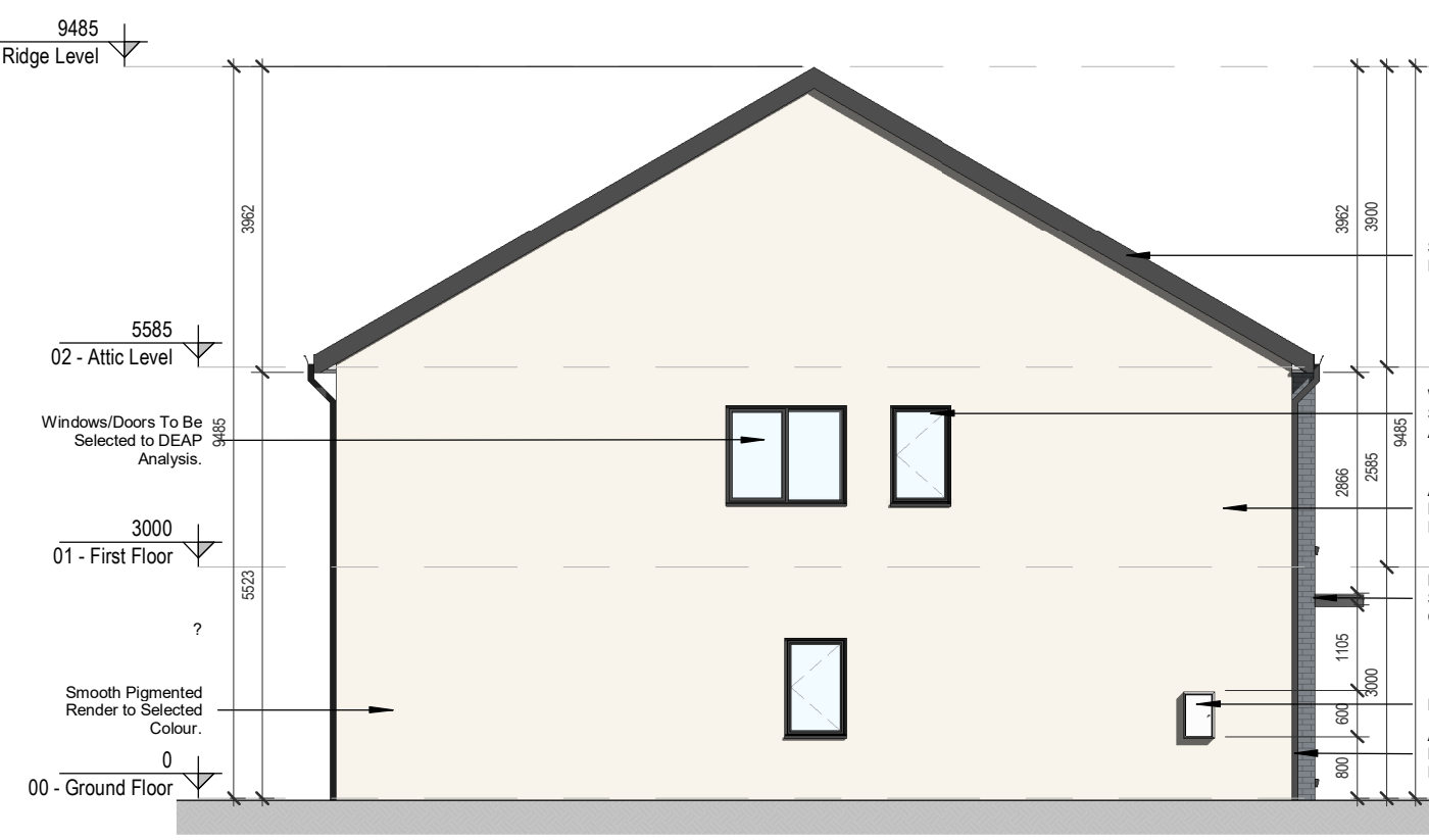
5 SIDE ELEVATION 1