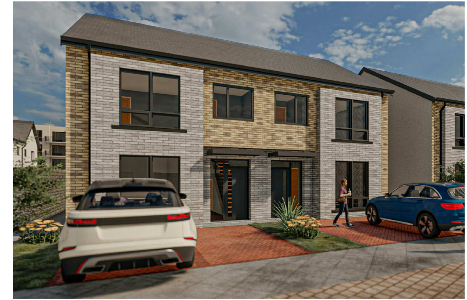
10 INDICATIVE 3D VIEW