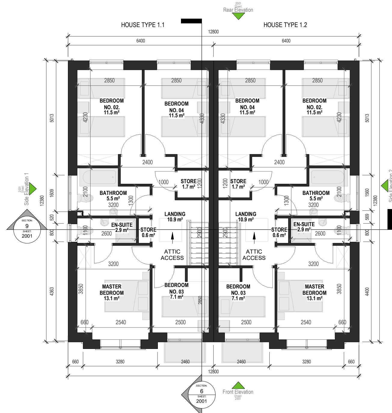
2 01 - PROPOSED FIRST FLOOR