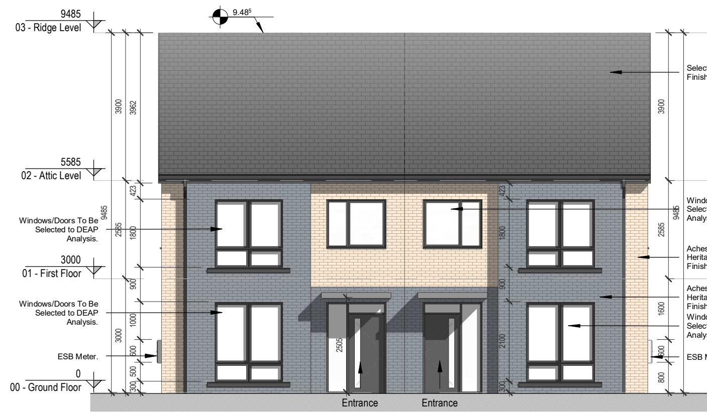
4 FRONT ELEVATION