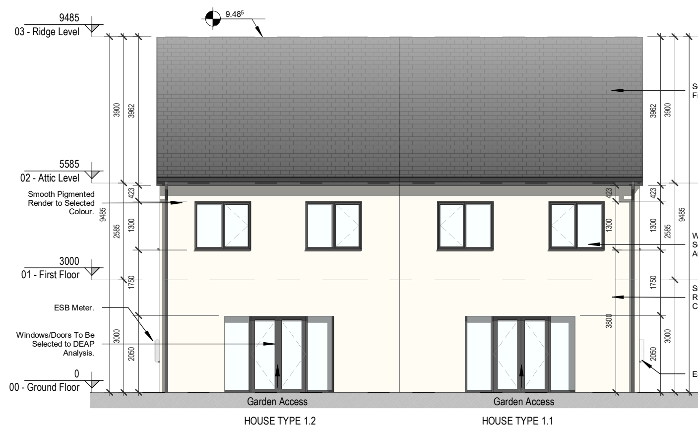
7 REAR ELEVATION