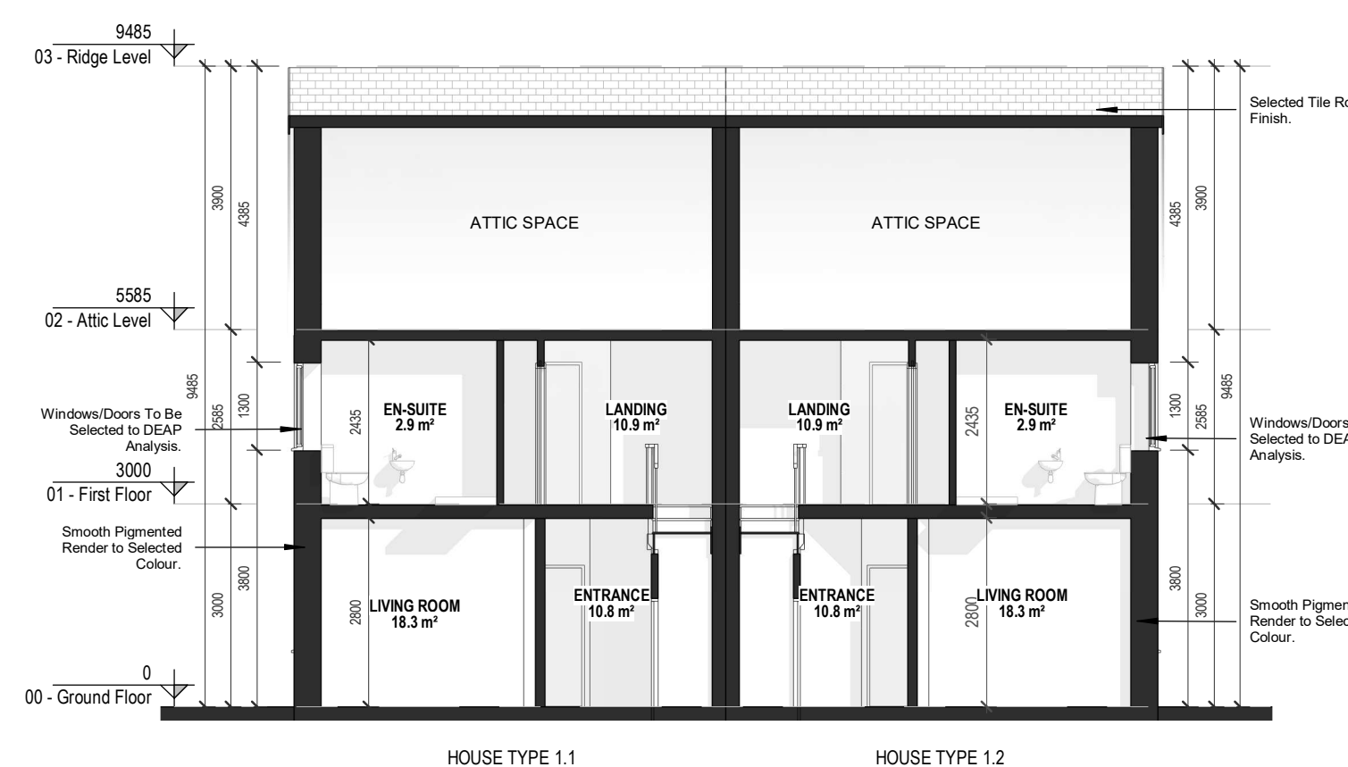
9 SECTION 2